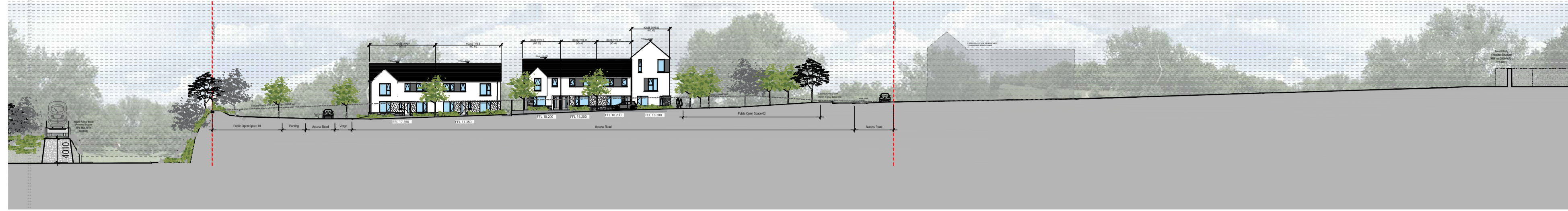
01 Site Context Elevation B-B Scale: 1:500