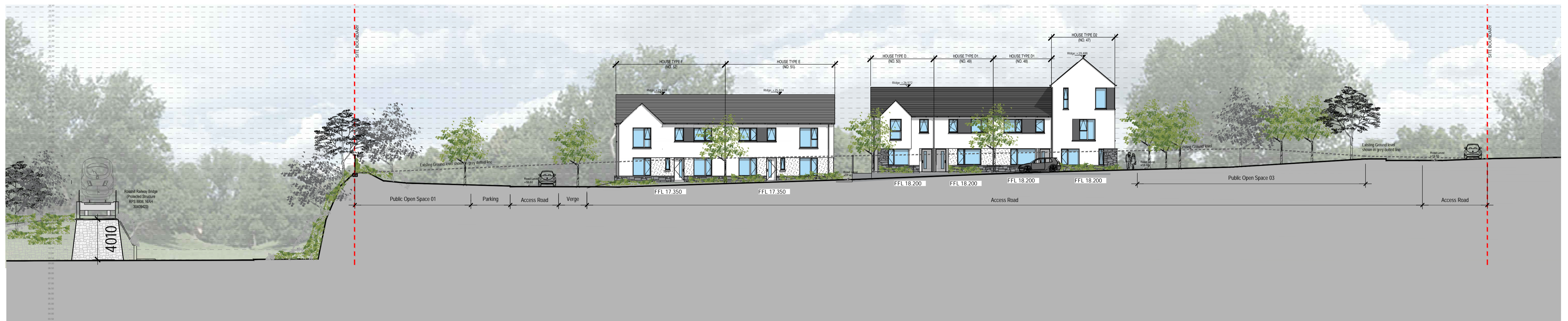
02 Site Context Elevation B-B (part 01) Scale: 1:200